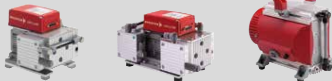
MVP 015-2 DC