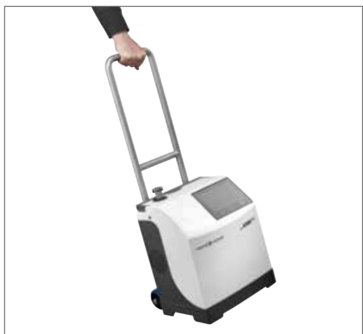
ASM 310 on a trolley