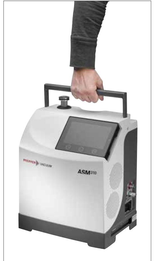
Highly portable with retractable handle