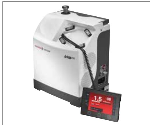
Detachable control panel (with approx. 2 m cable)