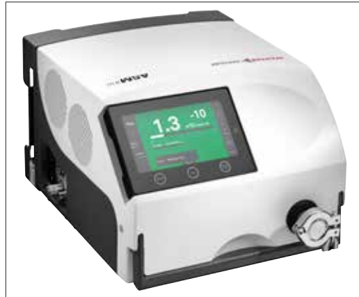
Can be operated in any position

The portable tracer gas leak detector combining ultralight weight and superior performance