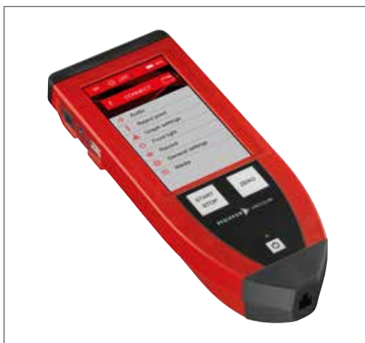
Remote control RC10